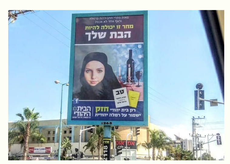
Jewish Home's campaign for the municipal elections in Ramle reads: "Hundreds of cases of miscegenation happen in Ramle and nobody cares. Tomorrow this could be your daughter. Only a strong Jewish Home will keep Ramle Jewish."

criminalize the activities of Palestinian activists on both sides of the Green Line, and a law which threatens to demolish the homes of tens of thousands Arab citizens of Israel. Will the Jewish Nation-State Law be the tipping point for the international community, or simply another piece of discriminatory legislation in a never-ending series? The international community, in partnership with progressive forces in Israel and Palestine, must resist Israeli apartheid on both sides of the Green Line and actively pursue self-determination, minority rights protections, peace, equality, solidarity, and social justice for all.