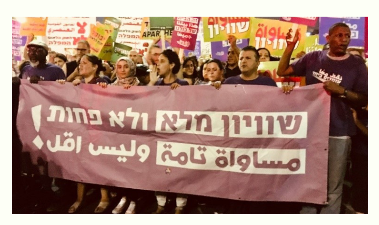
Protesters demand "Full equality and nothing less" at a demonstration against the Jewish Nation-State Law