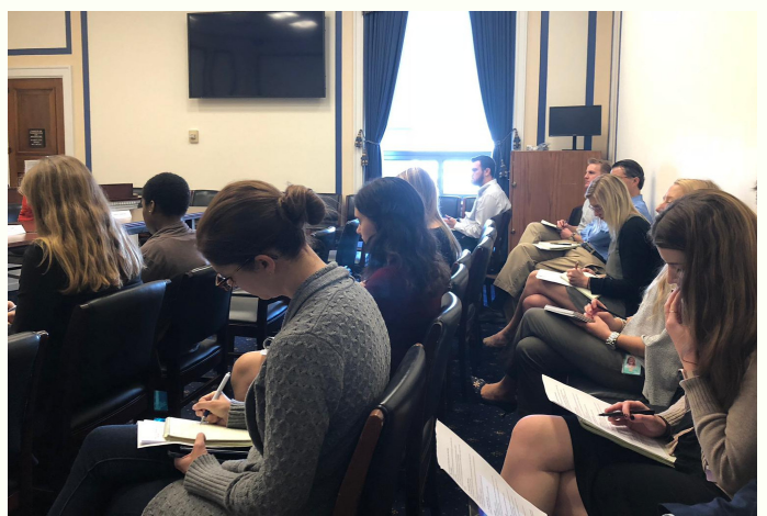
House Congressional staffers at an event organized by the Arab American Institute on Capitol Hill

The political gains made by the Arab and Palestinian American community in the United State not only inspire us in our own struggle for civil rights and social justice, but it also gives us hope. The passage of the Jewish Nation-State Law marks an incredible setback for Arab Palestinian citizens of Israel, a setback that left many of us wondering if and how Palestinian Arabs citizens of Israel will ever succeed in achieving equality. Ironically, the Mossawa Center's visit to the United States rekindled our hope. Needless to say, this is not the result of the current administration. Rather, we are hopeful because, for the first time in decades, we have noticed a genuine shift in US discourse around Israel and Palestinian rights, a shift that is entirely attributable to the organizing of the Arab Palestinian community in the United States.