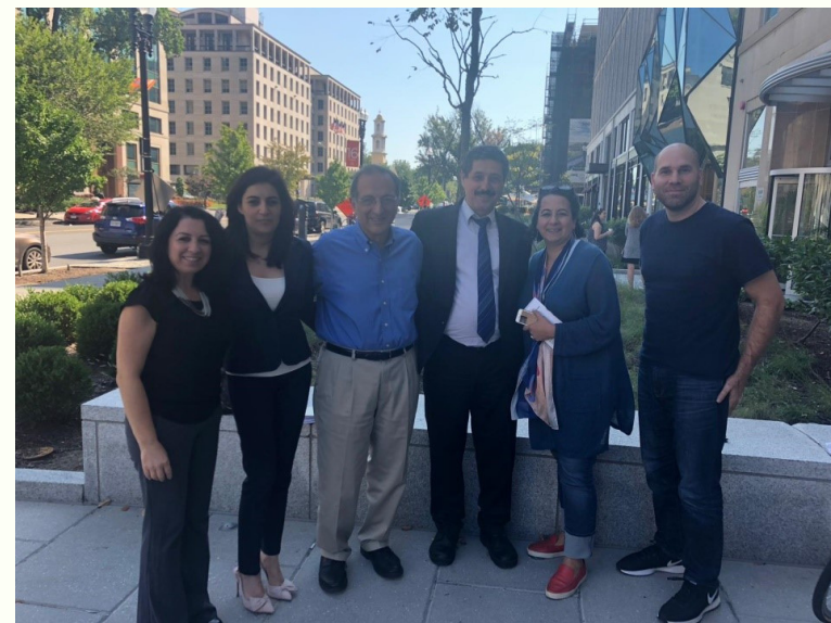
Representatives of the Mossawa Center and the Arab American Institute in Washington, D.C.