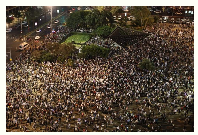
30,000 gathered to protest the passage of the Jewish Nation-State Law on August, 11 in Tel Aviv.