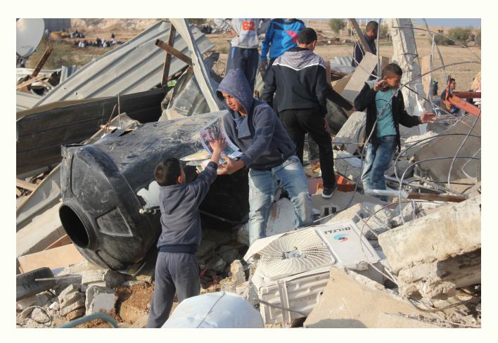
Children from Umm al-Hiran salvage what they can from their demolished homes.

The symbolic implications of the Jewish Nation-State Law run deep. As the Director of the Mossawa Center, Jafar Farah, told Senate staffers on Capitol Hill, "Before the passage of this law, Palestinian-Arab citizens still held onto the dream that they might one day be equal. This law kills that dream." As a result of this, members of the Palestinian-Arab community have renewed calls to boycott the national elections, rendering the settler movement's attempts to sideline Arab political forces successful. Meanwhile, the Jewish Nation-State Law normalizes and empowers extremist forces within Israel who now feel even more justified in their belief that the state of Israel is a state by and for the Jewish people exclusively, rather than by and for all of its citizens.