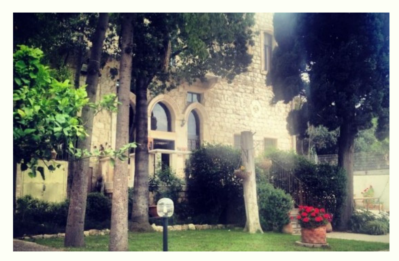
The Mossawa Center in Haifa

The Mossawa Center is currently accepting applications to intern at its headquarters in Haifa. Interns work closely with the international advocacy team, composing project proposals, reporting to donors, and coordinating the Mossawa Center's international outreach. All internship positions are full time and require a commitment of at least six months. Intern responsibilities include drafting narrative project reports and grant proposals for international donors; composing press releases for international media; updating Mossawa's contact database with project partners, international donors, and the international press; preparing reports for dissemination to international governmental and nongovernmental bodies, updating the English website and social media accounts; and supporting the organization of conferences and events for international missions. All interns must possess a Bachelor's degree or its equivalent, as well as high proficiency in English. Preference will be given to candidates with previous international experience and knowledge of Arabic and/or Hebrew. For more information, please contact international@mossawa.org. To apply, please send a resume or CV and a brief cover letter to international@mossawa.org.